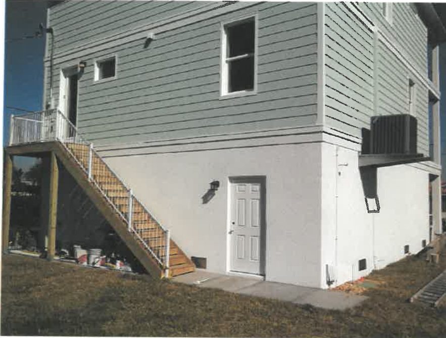
SOUTH SIDE/REAR VIEW – PHOTO TAKEN 11/21/2016

If submitting more photographs than will fit on the preceding page, affix the additional photographs below. Identify all photographs with: date taken; "Front View" and "Rear View" and, if required, "Right Side View" and "Left Side View." When applicable, photographs must show the foundation with representative examples of the flood openings or vents, as indicated in Section A8.