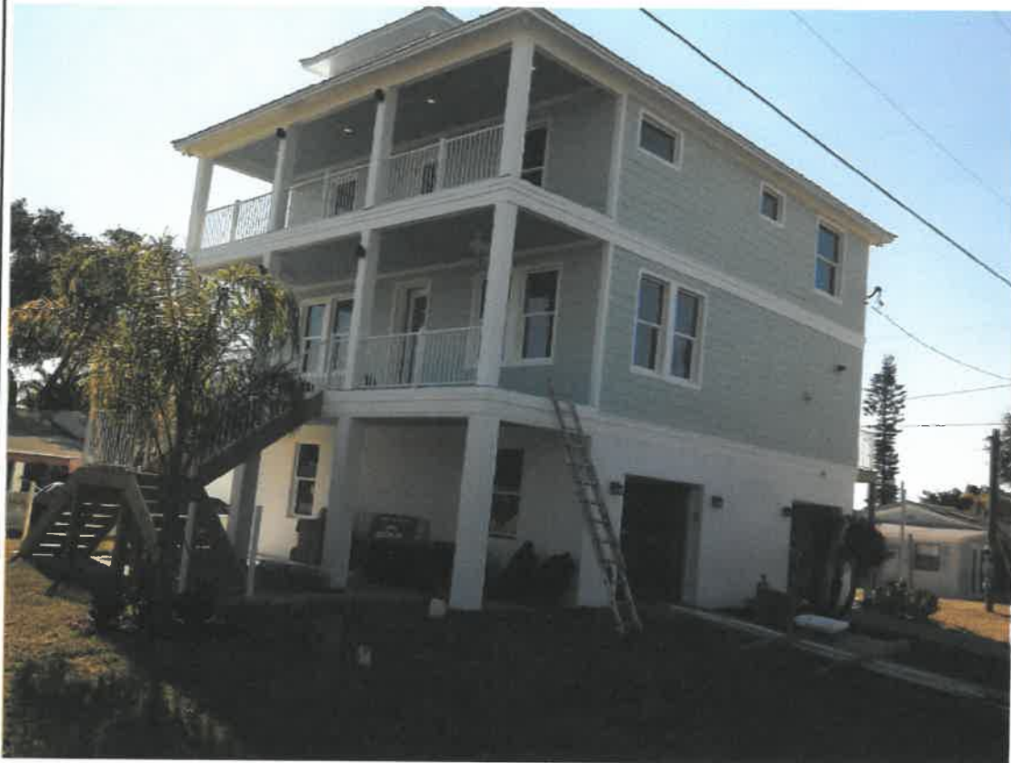
FRONT VIEW – PHOTO TAKEN 11/21/2016

If using the Elevation Certificate to obtain NFIP flood insurance, affix at least 2 building photographs below according to the instructions for Item A6. Identify all photographs with date taken; "Front view" and "Rear view"; and, if required, "Right Side View" and "Left Side View." When applicable, photographs must show the foundation with representative examples of the flood openings or vents, as indicated in Section A8. If submitting more photographs than will fit on this page, use the Continuation Page.