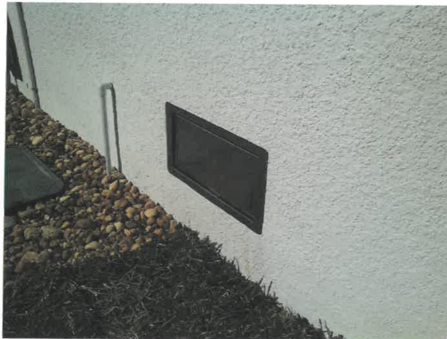
VENT – PHOTO TAKEN 11/21/2016