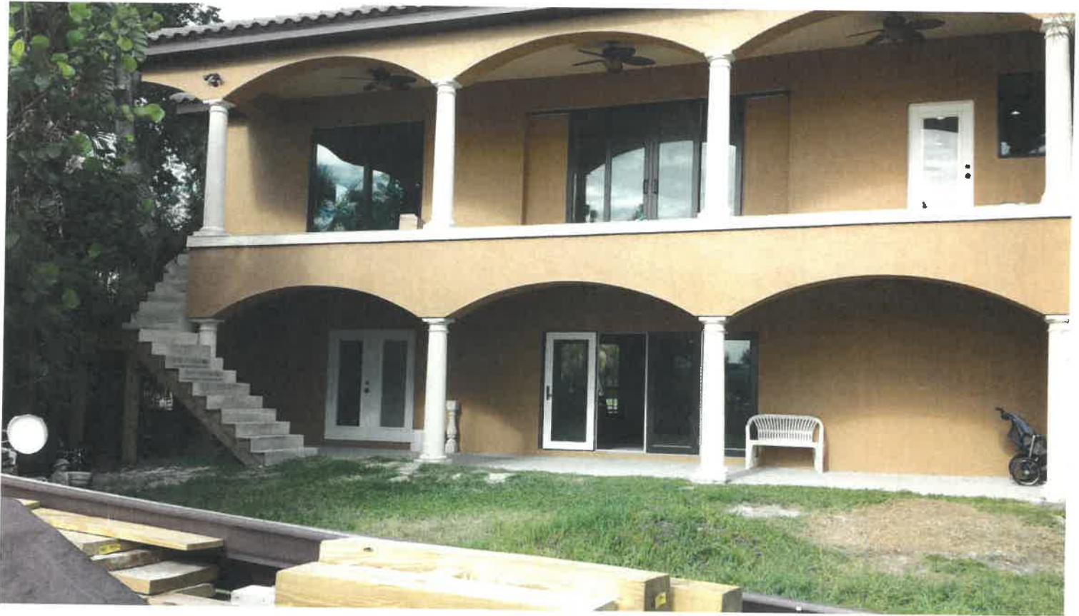
Rear of House

If submitting more photographs than will fit on the preceding page, affix the additional photographs below. Identify all photographs with: date taken; "Front View" and "Rear View"; and, if required, "Right Side View" and "Left Side View." When applicable, photographs must show the foundation with representative examples of the flood openings or vents, as indicated in Section A8.