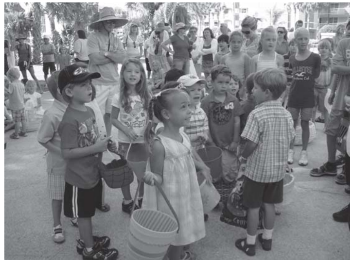
Children anticipating the start of the Easter egg hunt

Once again, the Easter Egg hunt was a blast for all. The Easter bunny arrived to kick off the hunt. Over 150 children attended the event to hunt eggs, play games, and enjoy activities with friends and family. We look forward to seeing you all again next year!