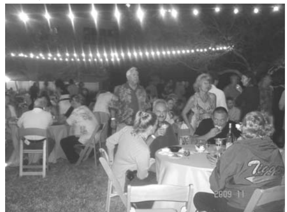
Friends mingling at the 2009 Wine Fest

The Redington Beach Wine Fest has been referred to as, "The social event of the year" by residents and local sponsors. This year we hope for it to be bigger and better than ever with more food and fun! Mark your calendar and save the date, November 6th at Friendship Park!