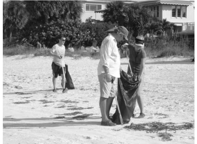
Residents pitching in at last year's beach cleanup

On Monday, July 5th, we head out to the beach to clean up after the July 4th festivities. We supply the tools and water while residents pick up debris. It is a group effort of caring citizens helping to keep our beach beautiful. Volunteers, please show up at the Beach parking lot at 8am. No pre-sign-up required.